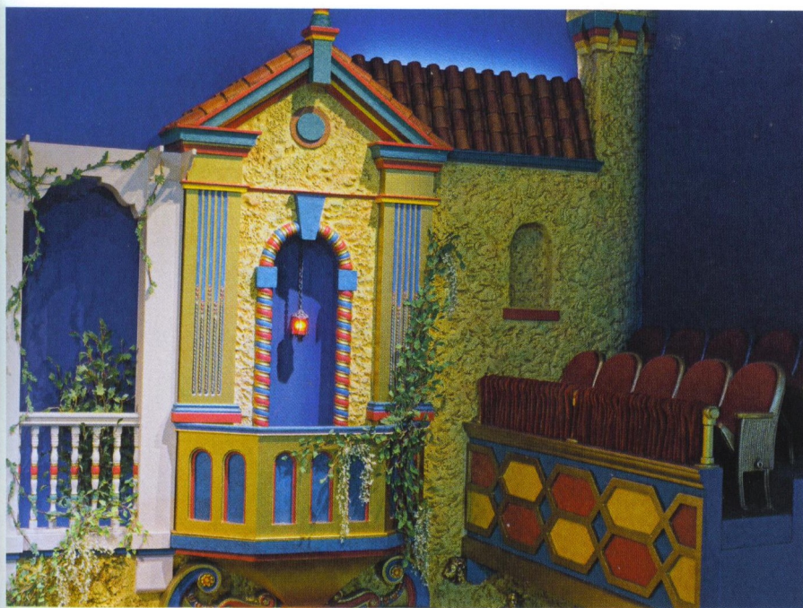
ABOVE: The original Russell Theatre was built in 1929 in Spanish architectural style and designed to give theatergoers the illusion they were in an enchanted Mediterranean garden.