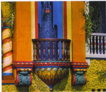
ABOVE: The Russell Theatre miniature interior features several private balconies, illustrative ceiling paintings, and ornately carved Spanish décor. It's truly a masterpiece.

for everyone by recreating the theater in 1:12 scale as it looked in 1953, complete with The Stars Are Singing advertised brightly on the mini marquee. The interior, says Allison, was the most labor-intensive project they have completed to date. The interior features private balconies, illustrative ceiling paintings, and ornately carved Spanish décor. Ashby and Jedd created hundreds of custom molding pieces to replicate the theater's original jewel-toned color scheme and used more than 1,000 pieces to handcraft and upholster the 100 theater chairs. The artists scraped through layers of paint at the theater to verify the original color palette and relied heavily on research, old photographs, and news articles to preserve the historical integrity of the piece. They also listened intently as Kaye described her childhood experiences at the theater. One, in particular, stood out.